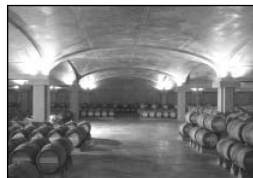
Ch. d'Yquem's chais.

Like all great wines , Ch. d'Yquem's essential quality stems from the soil. But Yquem also enjoys ideal exposure to the sun, and its proximity to water encourages the onset of botrytis in the fall—concentrating the sugars further and adding layers of complexity.