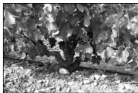
One of the old Garnacha vines of Propiedad.

The 2001 vintage produced splendid wines throughout Northern Spain—particularly in Rioja. It was also a vintage when even little-known Rioja producers reached for the gold ring, pricing their best wines above $100.