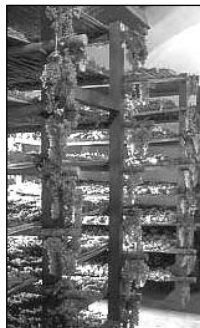
Vin Santo grapes drying over the winter.