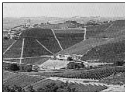
Asili (left) & Rabajà (right)