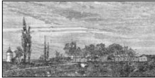
An early engraving of Ch. La Tour Blanche

At the time of Bordeaux's 1855 Classification, Château La Tour Blanche was ranked second only to Yquem—occupying a loftier position than even Climens and Rieussec.