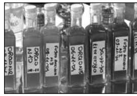
Lining them up at Selvapiana.

Year in, year out , Rufina’s most famous wine estate, Selvapiana, produces some of Tuscany’s most exciting olive oils. And each November, we have the privilege of tasting up to two dozen different pressings, to select our offerings for the year.