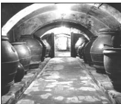
Lilliano's 17th-century orcio room was built by the Medicis.

This year's sweet spot was the first week of November, producing a blend of 60% Frantoio, 30% Leccino, 5% Moraiolo and 5% Pendolino olives, with a low acidity of .19%. It is a beauty: lustrous green