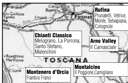
The birthplaces of our 2006 Tuscan oils.

pressed to extract oil and water, with the water separated off either by gravity or by using a centrifuge. No chemicals or heat are used. It is also crucial that the fruit arrive at the frantoio (the press house) speedily and unbruised. Otherwise, the olives will oxidize and develop a high level of oleic acid.