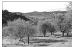
A Tuscan oliveto .

One of the many popular misconceptions about olive oil is that it is best used for frying and salad dressings. True, the destiny of cheap oils may be to fry with, and the metier of light, characterless oils is to dress a salad. But a rich, aromatic top-rank Tuscan oil has a higher calling.