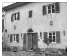
The villa at Melograno

Yields were again tiny in 2006 (barely 12%) and the best oils were pressed later than normal, after cooler temperatures arrived, giving the olives a final week to develop.