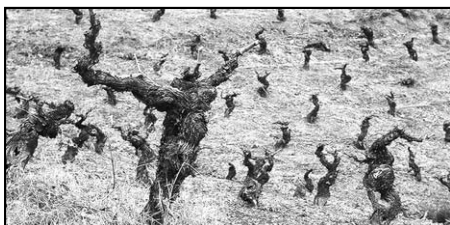
Old Mencía vines in Fontelas

Our offer of all these wines follows on the next page. As you'll see, the single- cru wines represent miniscule production; so, to maximize the number of customers who can experience them, we are again offering them as an assortment—one bottle of each, plus a bottle of Corullón —at a special low price. We can, in addition, offer Corullón and small quantities of San Martín and Las Lamas on their own. Finally, we can offer a few painfully rare large format bottlings.