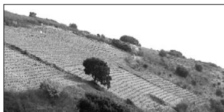
The slope of Monçerbal