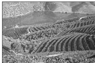
Quinta do Vargellas

Special cuvées —particularly from old vines—have always been rare in Vintage Port. Since 1931, there has of course been Quinta do Noval's Nacional, made from a parcel of ungrafted vines, but few others of note.