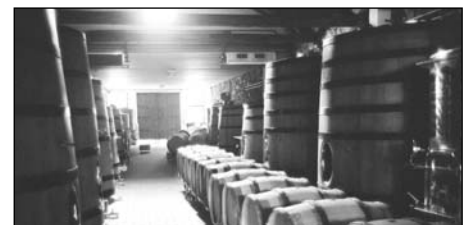
Descendientes' cellars in Corullón