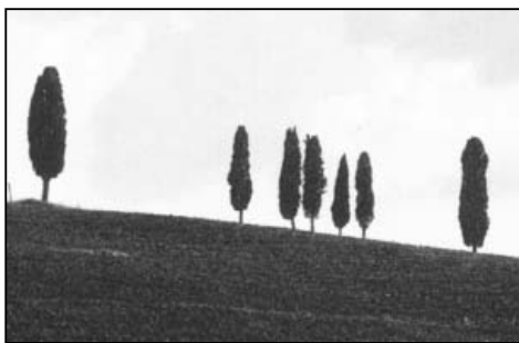
The sensuous hills of Montalcino.

Gathering together these stars has presented a particular challenge, given their small production and limited distribution. But we have succeeded in rounding up most of the hardest-to-find, highest-scoring wines. For many of these Brunellos, this may be your only chance to buy them. Quantities are limited. ☛