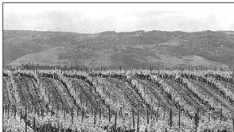
Les Chassis, Thalabert's home.

Since its release 15 years ago, the '90 has not only acquired a cult following, it has continued to put on weight ►