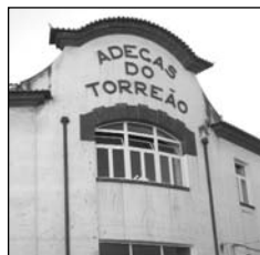
At left, Pereira D'Oliveira's cellars, dated 1619, and at right, Adegas do Torreão's cellars from 1949.

chose not to continue his work, eventually selling all of the company's assets to D'Oliveira.