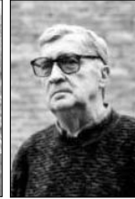
Mascarello & Giacosa