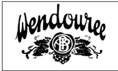
Above, one of Adelina's old Shiraz vines and the old Wendouree logo.

yard; thus their approach is minimalist and completely traditional—including an extended post fermentation maceration on the skins for up to fifty days—that honors the heritage of this historic site.