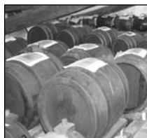
Barrels resting at Acetaia del Cristo

As in years past, we're honored to feature the glorious vinegars of Acetaia del Cristo, unquestionably Modena's