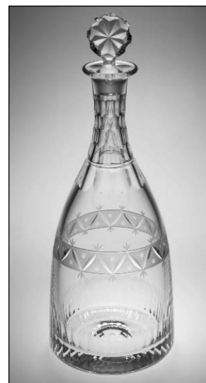
To learn more, go to "Classic Wine Decanters" at www.rarewineco.com

Attention California residents. Proposition 65 WARNING: Consuming foods or beverages that have been kept or served in leaded crystal products will expose you to lead, a chemical known to the State of California to cause birth defects or other reproductive harm.