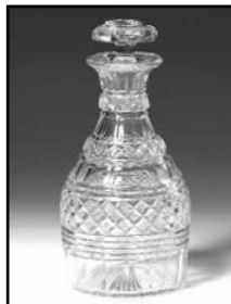
L11. George IV Decanter, mushroom stopper. English, c. 1820. $850.00