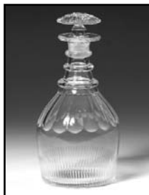
L10. George III Decanter with mushroom stopper. English, c. 1800. $895.00