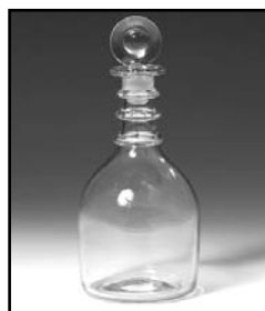
L5. George III Decanter, bull's-eye stopper. Irish, Belfast, c.1790 $925.00

The decanters shown here are among those available for delivery the week of December 10th. Photographs of the others are available on our website www.rarewineco.com , or by fax or e-mail on request. Decanters are 750ml bottle size unless noted.