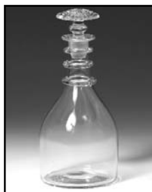
L8. George III Decanter with molded mushroom stopper. English, c. 1800. $1150.00