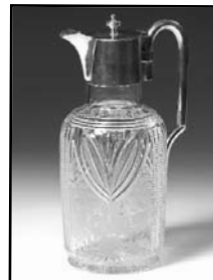
L21. Victorian Claret Jug, silver plated. English, c. 1890. $750.00