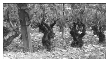
Pouilly-Fuissé La Roche