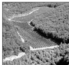
The Sportoletti winery and vineyards