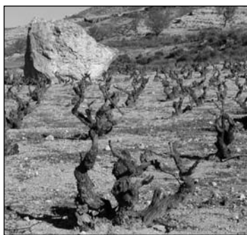
Atauta's priceless old vines

Robert Parker on 2000 Atauta Valdegatiles