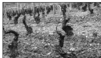
St. Véran Vieilles Vignes