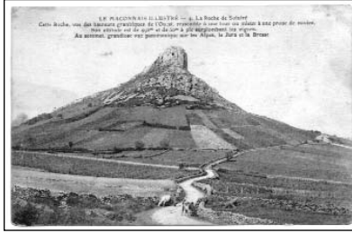
The best old vineyards of Deux Roches are on the slopes of the famed La Roche de Solutré, pictured on this early 20th-century postcard.

Like the other top Deux Roches cuvées below, the Terres Noires is produced from a single site, located on the back (south) side of the mountain as pictured on the old post card above. The site is covered by a layer of