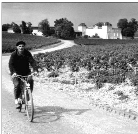
Times have changed at Calon Segur since this photograph was taken in the 1960's. For the first time in history, its wine should pass the $100 mark before it is even in bottle.

Now that the en primeur campaign has begun, it is clear that there will be enormous market pressure on these few wines. Compounded by a very weak dollar, even the opening prices of some wines—especially the First Growths—may leave buyers gasping. Many top prices will set new records, eclipsing even 2000 when there were far more wines to