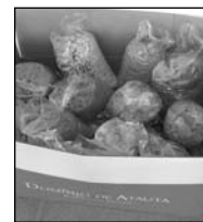
Parcel-by-parcel soil samples awaiting analysis.

The selection process that produced Valdegatiles in 2000 and Llanos del Almendro in 2001 is an outgrowth of Bertrand Sourdais' belief that Atauta's cool microclimate—like those of Burgundy and Piedmont—tends to render differences in terroir in finer detail than you find in warmer zones. Consequently, Bertrand not only vinifies every site separately, he has catalogued virtually every square meter of land in the domaine for soil type and structure, mineral content, root depth and ground water—in search of the secret to variations of body, depth, perfume and weight.