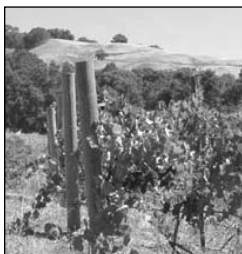
The Cerise vineyard.

Wells contracts for sections reflecting varied clones and rootstocks; in the 2004 Cerise, for example, five different Pinot clones are represented. Wells pushes the grower to pick as soon as physiological maturity is achieved, thus keeping alcohol degrees to about 14%.