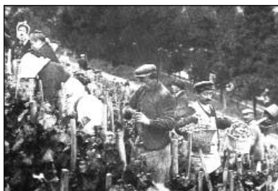
Harvesting Clos des Goisses' slope in the 19th century. In 1935, Philipponnat created the first single-vineyard Champagne from this site.