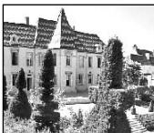
Bouchard's home: the Ch. de Beaune