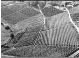
The Bussia vineyard.

For nearly three decades, Aldo Conterno's Granbussia has been counted among the world's most coveted red wines—prized for its profound quality as well as for its scarcity, with fewer than 600 cases made.