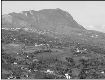
The view from the Molettieri estate.