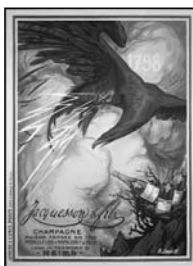
Jacquesson's famous 1920s poster

Cuvée 730's components are 60% from the 2002 vintage and 40% reserve wines—all premier and grand crus . The varietal make-up is quite different from its two predecessors, with a higher percentage of Chardonnay (50%) and correspondingly less Pinot Noir and Pinot Meunier. Half the cuvée was fermented in