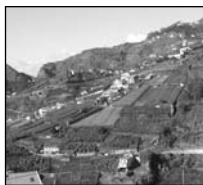
Cama do Lobos

If you turn 50 this year, and you've been searching for birthyear wines, you've undoubtedly found the pickings slim. For this, you can thank the freeze that swept across France in January, 1956, wiping out vineyards from Bordeaux to Provence. Vast replanting was needed, and little wine was made that year.