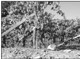
25-year-old Syrah vines in Obsidian's rocky soil

In recent decades, Syrah has enjoyed an explosion of interest in California. But until Pax Mahle, few Californians had attempted to capture the magic of the Northern Rhône, crafting great Syrah from relatively cool sites.