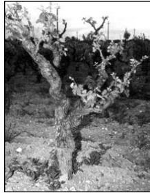
A venerable Primitivo vine

Southern Italy has countless old vineyards capable of producing great wines. Campania's Aglianico vineyards date back a century or more, and in Puglia, to the east, the Primitivo and Negroamaro vines are nearly as old. Yet, it was not until the past decade that the potential of these vineyards began to be realized.