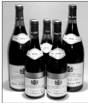
Two decades of La Grappe des Papes

Over time, Jaboulet came to bottle more and more of their own wines, including not only their famous Hermitage La Chapelle—made from their own vines—but also cuvées from purchased fruit. The most famous of these was their Châteauneuf du Pape labeled "La Grappe des Papes" (though for the U.S. and Britain, the wine was sold as "Les Cèdres").