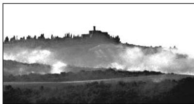
Montalcino above the fog