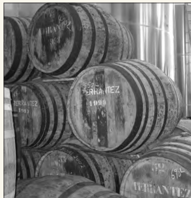
Terrantez casks at Henriques & Henriques from '98, '99 and 2001.

How rare is Terrantez today? According to the IVBAM, the agency that governs the Madeira trade, there is less than one hectare of Terrantez on the entire island. There's almost twice as much Romanée Conti! Terrantez is that rare.