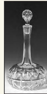
11-152 PAIR Victorian, onion, hollow ball stoppers, tall fluted necks, flattened bodies, thumbprints within panels formed by single prisms, radially prism-cut base. English c. 1870. $675/pr

Attention California residents. Proposition 65 WARNING: Consuming foods or beverages that have been kept or served in leaded crystal products will expose you to lead, a chemical known to the State of California to cause birth defects or other reproductive harm.