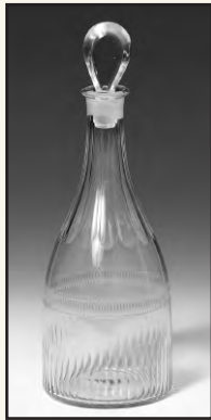
11-136 George III, taper, lozenge stopper, flat finger flutes, engraved tulip band, fine finger flutes at base. English c. 1780. $850

The decanters shown here are just ten of 20 decanters or pairs available for delivery in early December. Photographs of the others are available on our website www.rarewineco.com/decanter , or by fax or email on request. Decanters are 750ml bottle size unless noted.