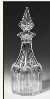
11-146 Early Victorian, tall club, spire stopper, fluted tall neck to shoulder, pointed Gothic arches cut within heavy pillar arches, star-cut base. English c. 1840. $560