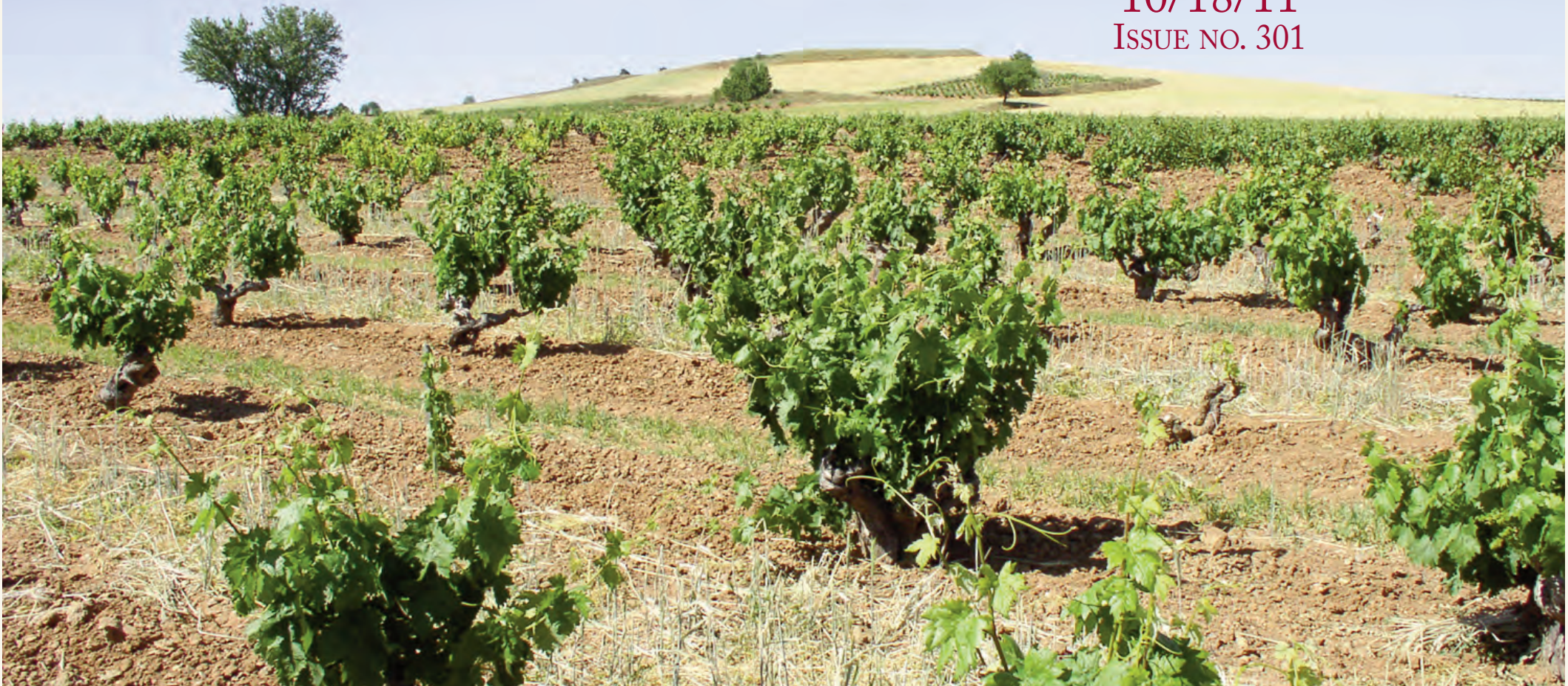
Old Tempranillo vines that produce Pingus. Page 1.