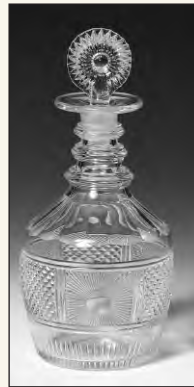
11-143 George III, prism stopper, 3 triple neck rings, flat finger flutes, alternating sun-blaze and diamond panels, fine prisms at base. Irish, possibly Cork, c. 1800. $795