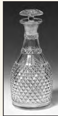
11-142 George III, club, mushroom stopper, 2 diamond-cut neck rings, flat flutes, body is diamond-cut. English/Irish c. 1800. $750