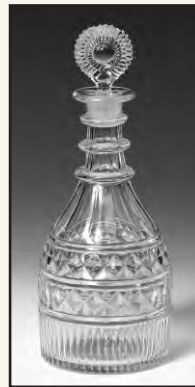
11-140 George III, club, prism cut stopper, 3 neck rings, flutes to shoulder, flat-cut diamonds, fine flutes to base. English/Irish c. 1790. $750