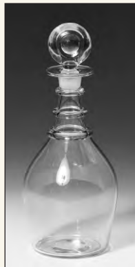
11-138 George III, shouldered club, bull's-eye stopper, 3 neck rings, plain classic body. English c. 1790. $850