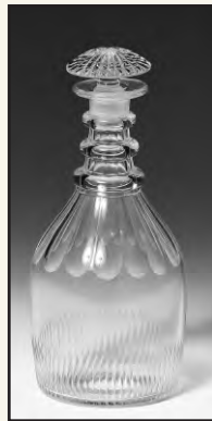
11-139 George III, club, mushroom stopper, 3 neck rings, cut fluted classic body. English c. 1800. $695