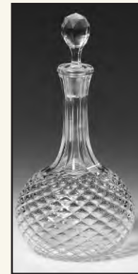
11-148 Victorian, onion, facet ball stopper, tall fluted neck, body wholly reticulated with diamonds. English c. 1860. $395