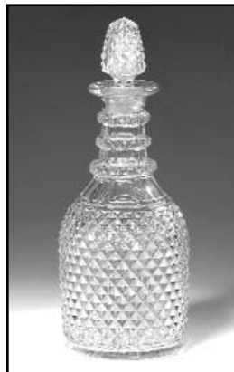
F9. Pair of George III Decanters with diamond cut stoppers, diamond cut neck rings, bodies wholly diamond cut. English/Irish c. 1800. $1850.00 pr.