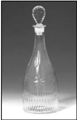
F1. George III taper Decanter with faceted lozenge stopper, flat finger flutes to shoulder & base, central band of single stars. English c.1780. $875.00

The ten decanters shown here were chosen from more than 30 decanters (or sets) that are available for delivery by the first week in December. Photographs of the others are available on our website www.rarewineco.com , or by fax or e-mail upon request.