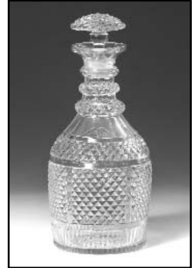
F20. Regency Decanter with mushroom stopper, 3 neck rings, flat flutes to shoulder, band of diamonds above panels of same, fine finger flutes at base. English c. 1810. $595.00