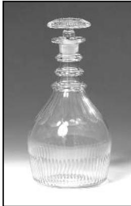
F3. George III Decanter with mushroom stopper, 3 triple neck rings, flat finger flutes to shoulder and to base. Irish c.1800. $670.00