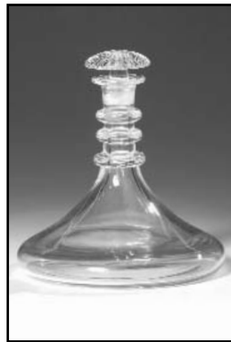
F28. George III-style Ship's Decanter with mushroom stopper, 3 plain neck rings, plain swept body. English early/mid 20th century. $450.00