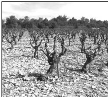
Ste. Anne's old Mourvèdre vines.

However, Sainte-Anne's quality is not just due to site and microclimate. It is also the result of the perfection-