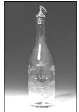
F10. Pair of Victorian Serving bottles and mounted corks, engraved 'Claret' & 'Burgundy' in cartouche with Union emblems: thistle, rose, shamrock & fruiting vine. English/Irish c. 1890. $750.00 pr.

Attention California residents. Proposition 65 WARNING: Consuming foods or beverages that have been kept or served in leaded crystal products will expose you to lead, a chemical known to the State of California to cause birth defects or other reproductive harm.