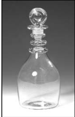
F2. George III Decanter with bulls-eye stopper, 3 neck rings, classic plain. English c. 1790. $695.00