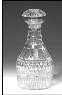
F4. George III Decanter with mushroom stopper, 3 flat neck rings, flat flutes to shoulder, band of broad diamonds above fine finger flutes English c. 1810. $645.00