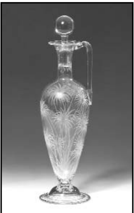
F6. Victorian Claret Jug with hollow ball stopper, footed amphora, engraved palm tree spray. English c. 1890. $570.00