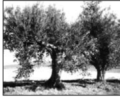
Century-old olive trees

As in past autumns, we are pleased to offer these further purchases, along with a few bottles set aside for this purpose from our Spring offering.