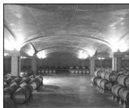
Ch. d'Yquem's chai.

Like all great wines , Ch. d'Yquem's essential quality stems from the soil. But Yquem also enjoys ideal exposure to the sun, and its proximity to water encourages the onset of botrytis in the fall—concentrating the sugars further and adding layers of complexity.