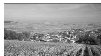
The Côte de Blancs crus of Comtes de Champagne, from left to right: Oger, Cramant, Le Mesnil and Avize.