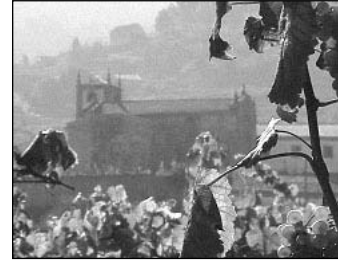
Quinta do Dorado