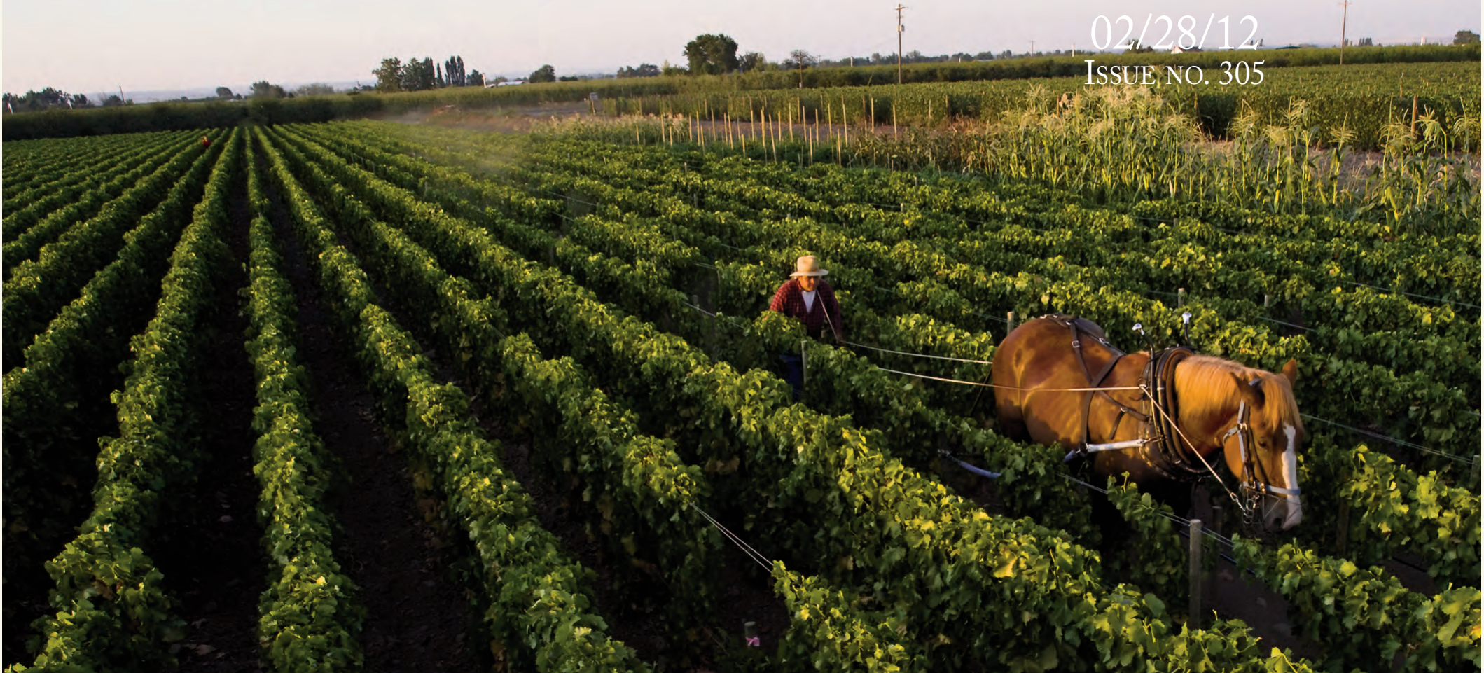
Plowing at Horse Power vineyard. See page 1.