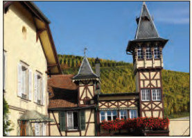
Trimbach's cellars in Ribeauvillé

Relative to their accomplishments, great winemakers have some of the smallest egos in the world.