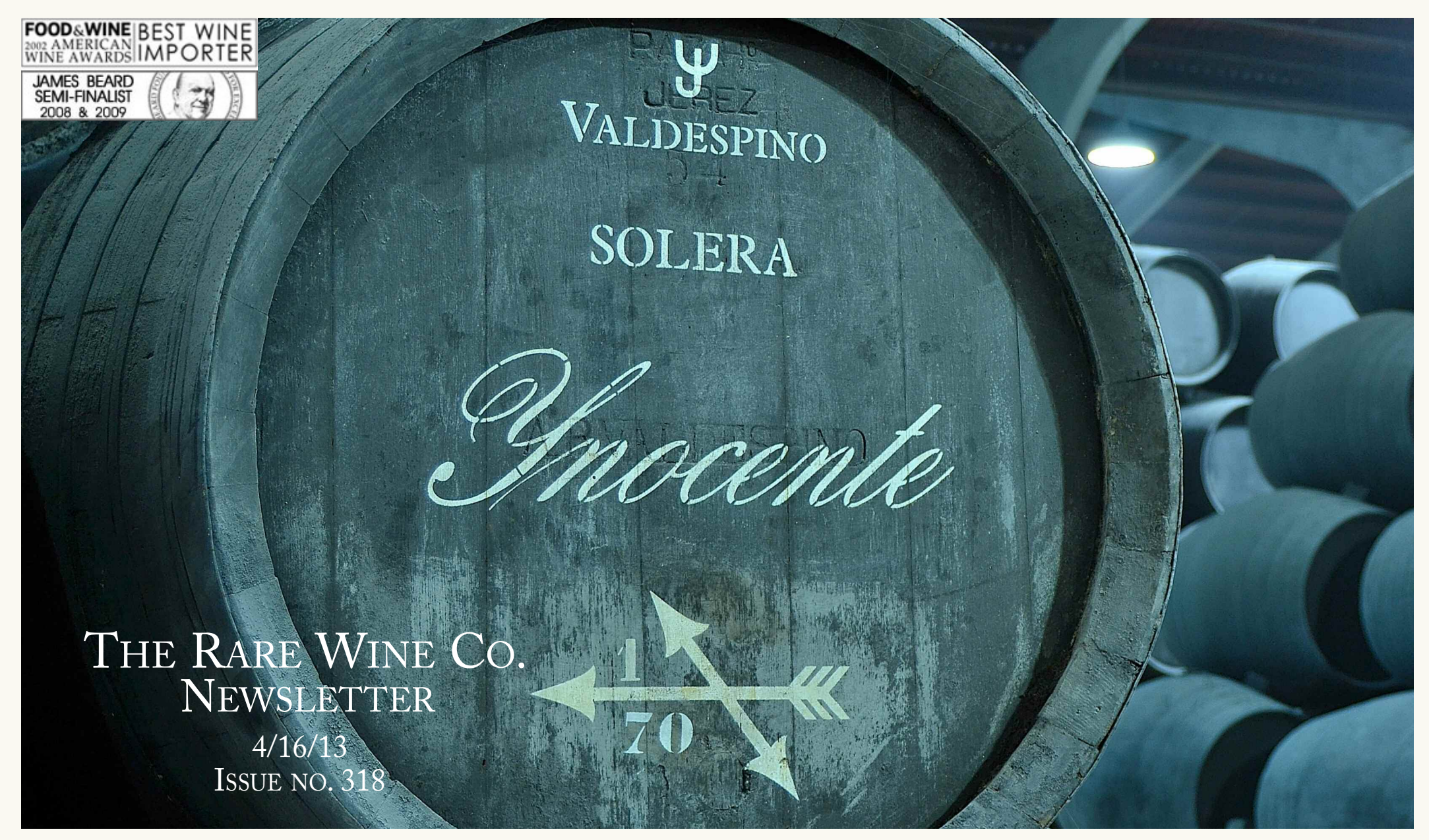
The Valdespino Solera that produces its iconic Fino Inocente.