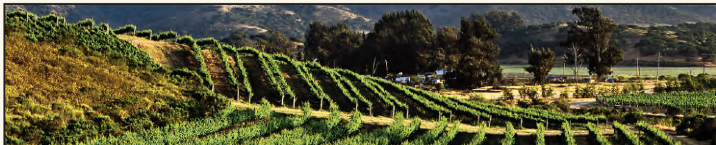
Melville's terraced vines.