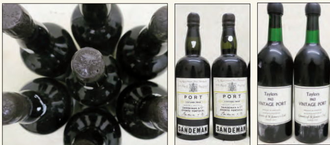
Left & Center: 1945 Sandeman capsules and labels. Right: The 1963 Taylor.

The '63 Cockburn above is not just from any UK country house cellar ... it's from one of the all-time greats. It represents a combination of superior conditions and an obsessive owner.