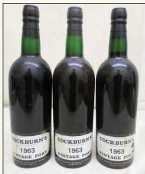
Our bottles from a UK country house

But in 1983, with its reputation on the line, Cockburn made arguably the wine of the vintage, sacrificing output to be sure its Vintage Port was without rival.