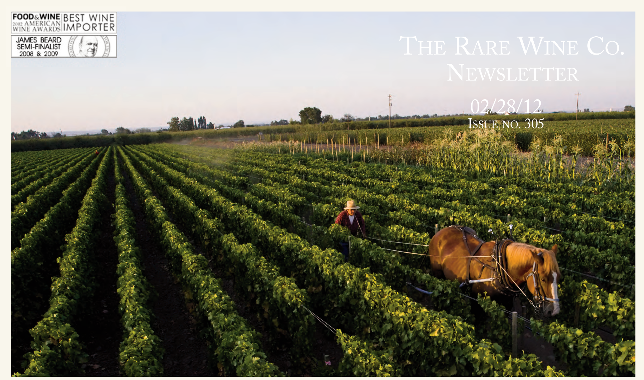
Plowing at Horse Power vineyard. See page 1.